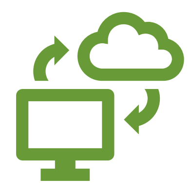
View resources and recording from this webinar: share.nned.net