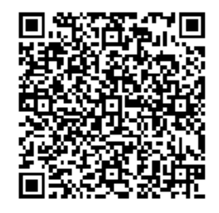
Feedback Survey: bit.ly/4dEGm5i