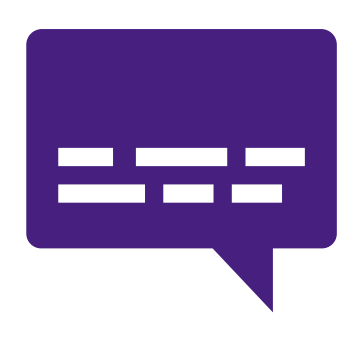
Share comments in chat